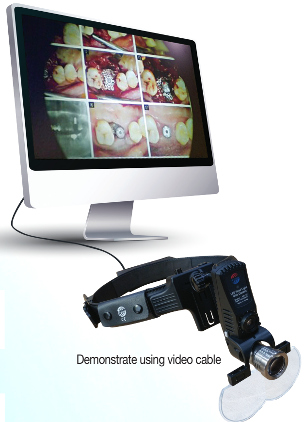
Demonstrate using video cable

It is provided own-use “K-scope Viewer” program. This is capable to make “time-reset” and “voice cancellation”