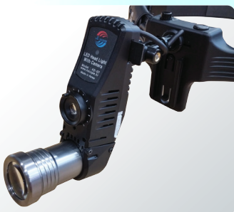
Light and Camera