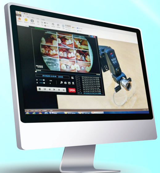
"K-scope Viewer" Program